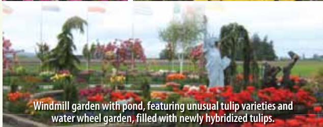
Windmill garden with pond, featuring unusual tulip varieties and water wheel garden, filled with newly hybridized tulips.