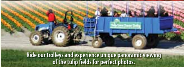
Ride our trolleys and experience unique panoramic viewing of the tulip fields for perfect photos.